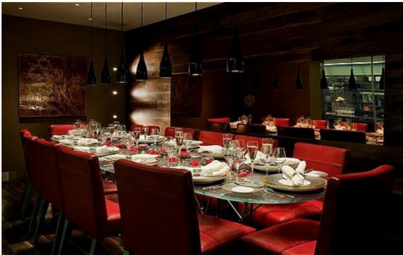
Krug Room at The Dorchester - The Dorchester in London, United Kingdom

The Krug Room is without doubt one of the most exciting dining rooms in London. Located within the hotel's master kitchens, it is the original 'chef's table' and was first opened in the 1940's. Recently redesigned, the space pays homage to the heritage, elegance and subtlety that is the underlying thread of both Krug's and The Dorchester's ethos.