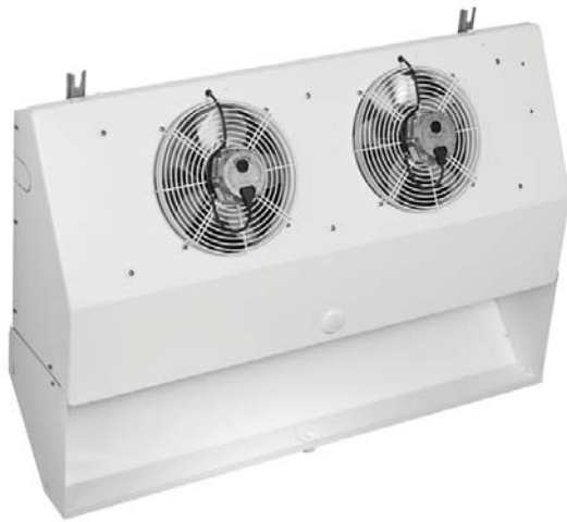
DLK/DLKT 612 with ESM (Energy Saving Motors), wall version, with special drip tray